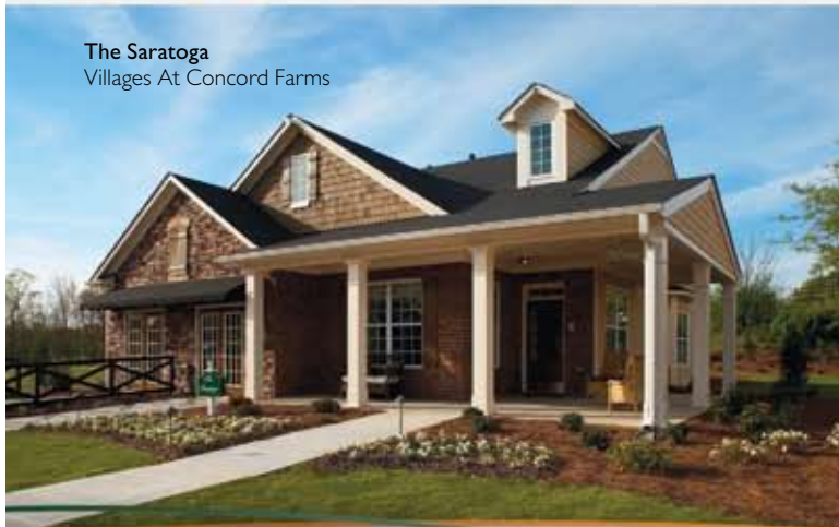
The Saratoga Villages At Concord Farms

Plus, if you are over the age of 65 you are entitled to a full School Tax Homestead Exemption .